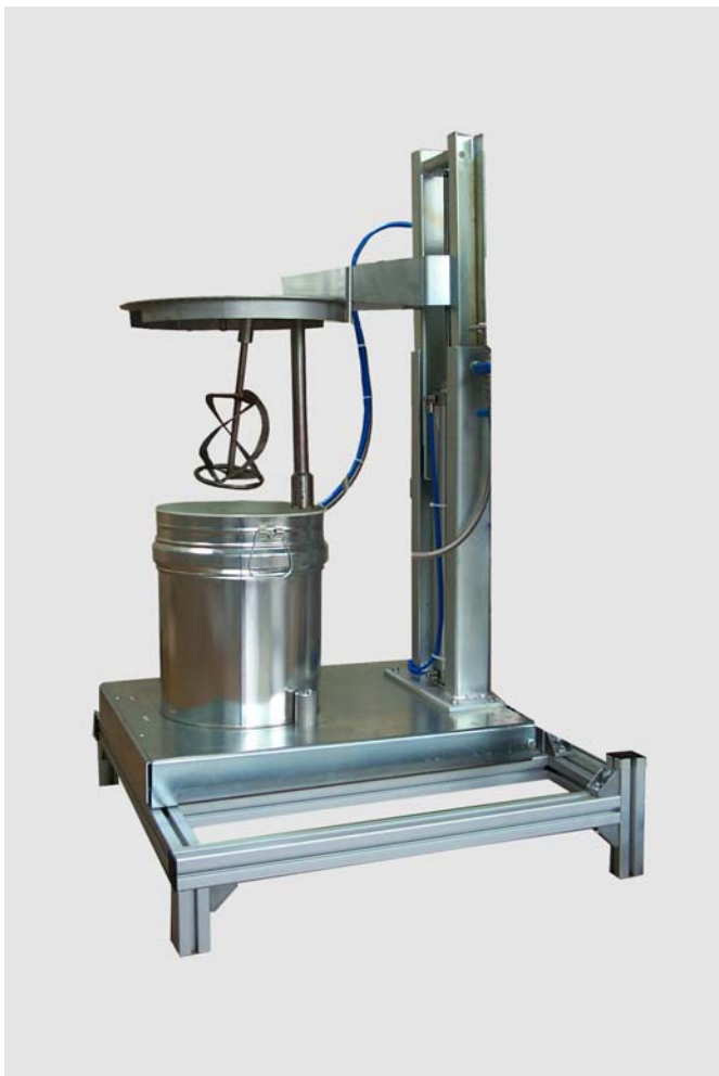
Level control with mounted barrel lid lifting device

The system developed by Reiter is based on customers needs. The gravimetric system monitors the container level without direct contact to the material. This improves the safety production eliminating any cleaning work when filling the material tank or changing colour.