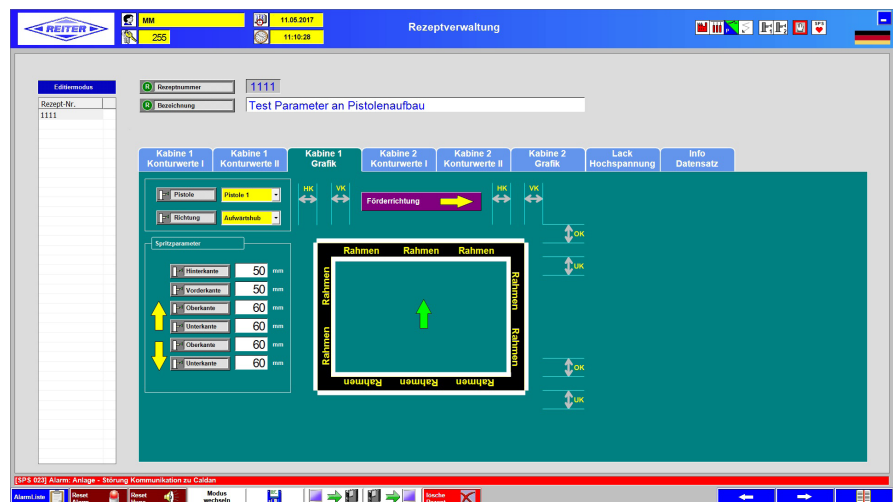
Virtual extension and reduction of work pieces. Individual setting of every spray gun trigger point.