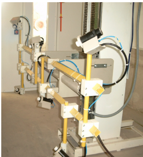
Reciprocator with insulated support and reproducible spraying system holder