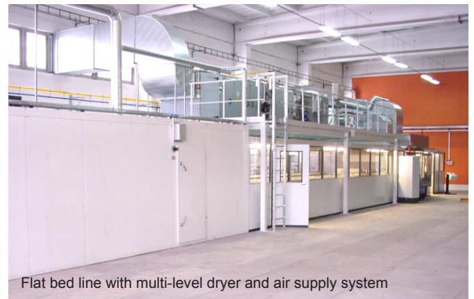
Flat bed line with multi-level dryer and air supply system