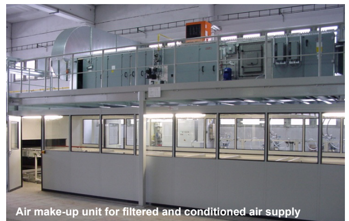
Air make-up unit for filtered and conditioned air supply