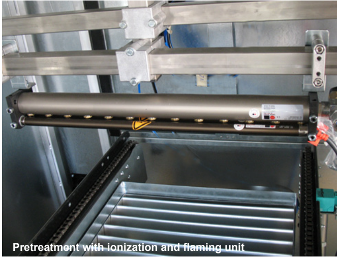
Pretreatment with ionization and flaming unit

PERFECT FINISH – PAINTED BY THE SPECIALIST.