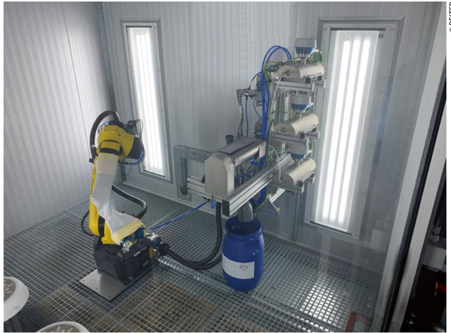
Dosing technology with Coriolis flow meter.

To ensure the required reproducibility and quality of the coating, the engineers rely on the monitoring of all process parameters. The air volume specified in the programme is monitored separately for the fan air and the atomiser air by means of flow sensors and deviations are evaluated. The desired material quantity is monitored via Coriolis measuring devices. Different quantities between only 5 and 250ml/min are applied, depending on the material. In addition, the temperature and density of the materials are measured, the correct rinsing and changing processes are monitored and evaluated for errors. The recording and logging of the consumption values for each coated component, together with the fault monitoring, allow an OK/NOK evaluation for each part and thus perfect process control.